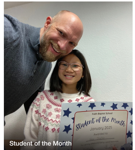
Student of the Month