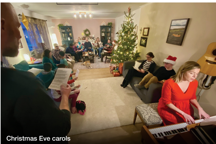
Christmas Eve carols