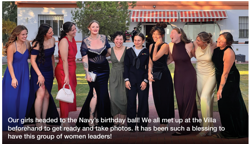
Our girls headed to the Navy's birthday ball! We all met up at the Villa beforehand to get ready and take photos. It has been such a blessing to have this group of women leaders!

This type of God-centered community is our goal as missionaries to the military, and God has placed in me a desire to continue in it. I have decided to pursue the Cadence candidacy process in order to become a full-term Cadence missionary after I finish my time with the Villa in May, 2026. I am incredibly excited that the Lord has placed this desire in my heart to serve the military community.