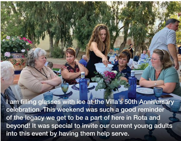
I am filling glasses with ice at the Villa's 50th Anniversary celebration. This weekend was such a good reminder of the legacy we get to be a part of here in Rota and beyond! It was special to invite our current young adults into this event by having them help serve.