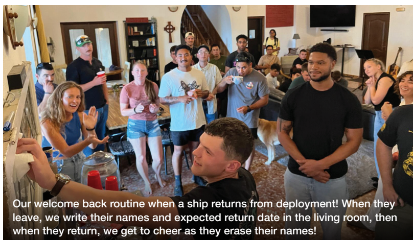
Our welcome back routine when a ship returns from deployment! When they leave, we write their names and expected return date in the living room, then when they return, we get to cheer as they erase their names!