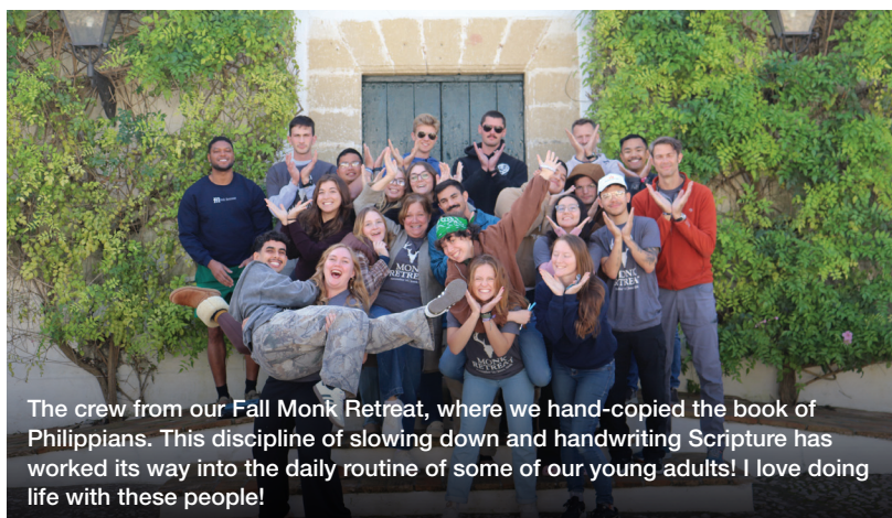
The crew from our Fall Monk Retreat, where we hand-copied the book of Philippians. This discipline of slowing down and handwriting Scripture has worked its way into the daily routine of some of our young adults! I love doing life with these people!