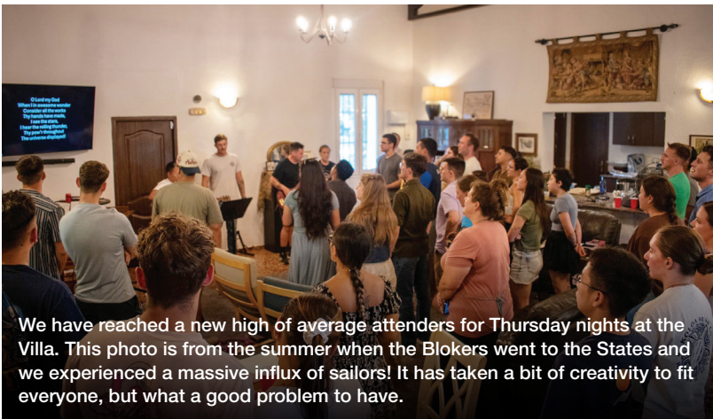
We have reached a new high of average attenders for Thursday nights at the Villa. This photo is from the summer when the Blockers went to the States and we experienced a massive influx of sailors! It has taken a bit of creativity to fit everyone, but what a good problem to have.