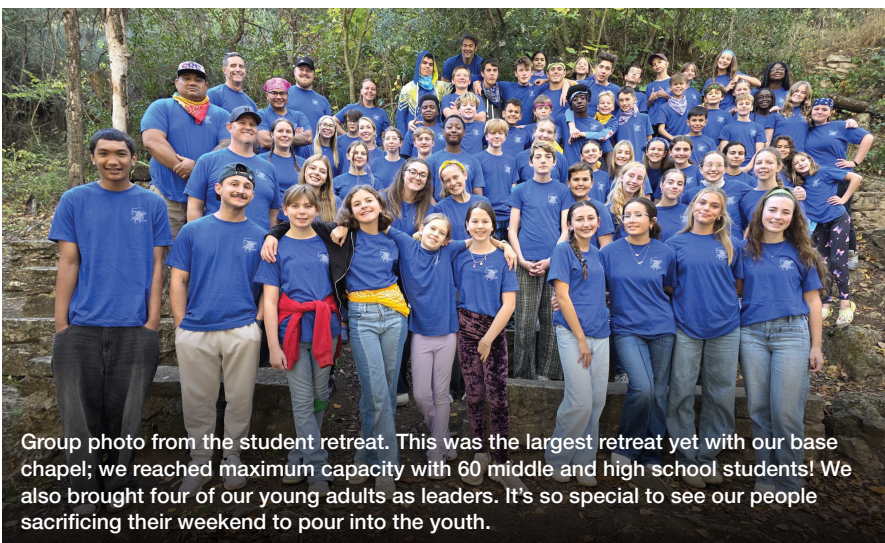
Group photo from the student retreat. This was the largest retreat yet with our base chapel; we reached maximum capacity with 60 middle and high school students! We also brought four of our young adults as leaders. It's so special to see our people sacrificing their weekend to pour into the youth.

One huge transition in my ministry this year was when my 8th-grade girls graduated from middle school, and I then transitioned to leading a small group of 6th-grade girls. I had led this first group since I first moved to Rota two years ago and did not realize the vast differences between the two ages. There's certainly a lot of growing up that happens in middle school! Although it has been different, I have thoroughly enjoyed getting to pour into these 6th-grade girls. I have learned how important face-to-face time is with kids. If you show up enough, they start to trust that you will be around and will let you into their lives.