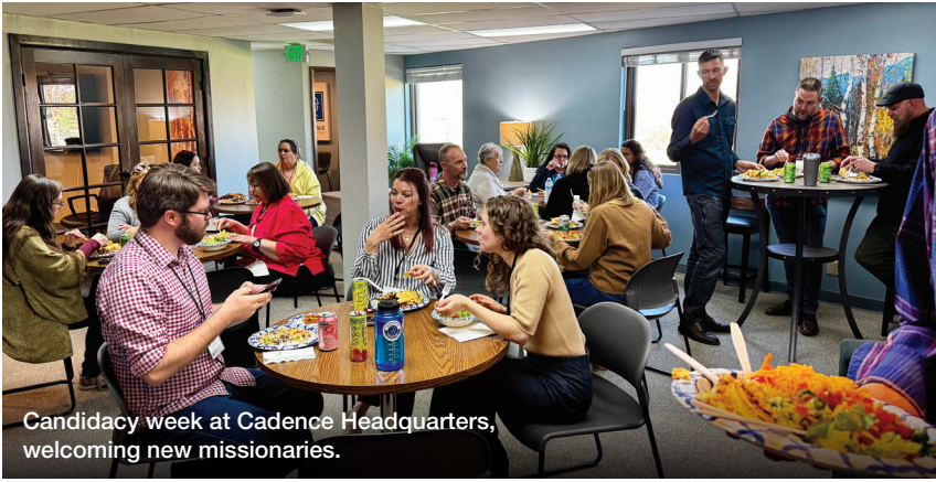
Candidacy week at Cadence Headquarters, welcoming new missionaries.