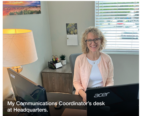
My Communications Coordinator's desk at Headquarters.