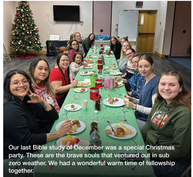
Our last Bible study of December was a special Christmas party. These are the brave souls that ventured out in sub zero weather. We had a wonderful warm time of fellowship together.