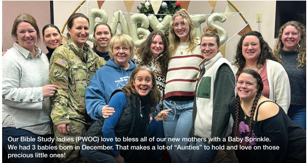
Our Bible Study ladies (PWOC) love to bless all of our new mothers with a Baby Sprinkle. We had 3 babies born in December. That makes a lot of "Aunties" to hold and love on those precious little ones!

Moving to Ambassador status will give me a more flexible schedule and freedom to pursue these desires. Please be praying for me as I move into this next season where the Lord has me.