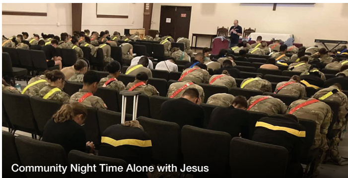
Community Night Time Alone with Jesus

In addition to biblical teaching, we dedicate time for small group discussions, and we conclude by providing trainees with time alone with God in a room full of people. This solo prayer time has been meaningful for many. We want to be faithful with this ministry God has given us. You are part of reaching so many trainees. Thank you for your partnership in ministry!