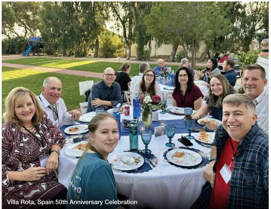
Villa Rota, Spain 50th Anniversary Celebration