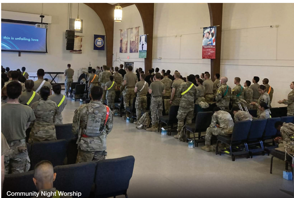
Community Night Worship