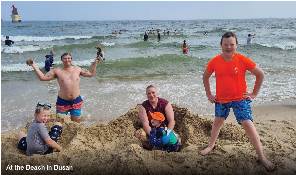
At the Beach in Busan

I love watching sunrises on the beach, so I got up early to see one. The beach was quiet and beautiful as I sat in the sand and watched the early morning swimmers and runners. My Bible was open on my lap, and an elderly Korean man noticed as he walked by. He approached me with a smile and asked me what I was reading. When I told him, he smiled even bigger and said, “I’m a Christian too!” After