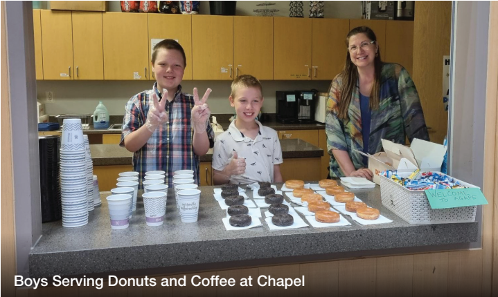
Boys Serving Donuts and Coffee at Chapel