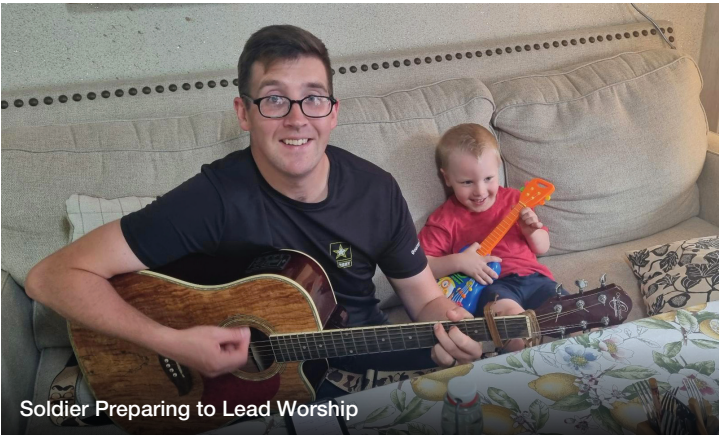
Soldier Preparing to Lead Worship