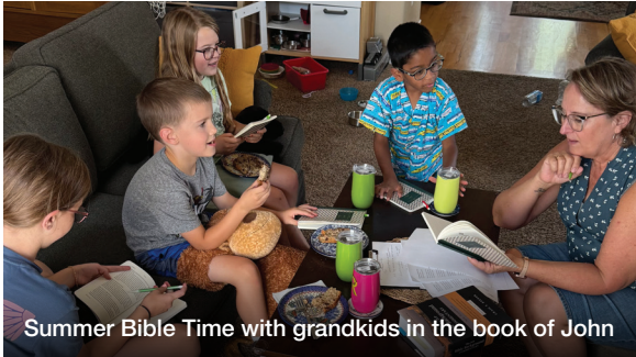
Summer Bible Time with grandkids in the book of John