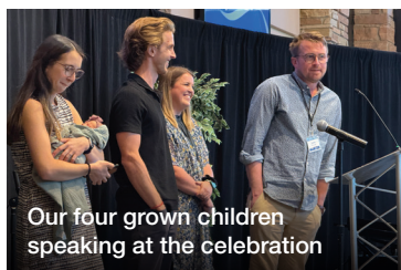
Our four grown children speaking at the celebration