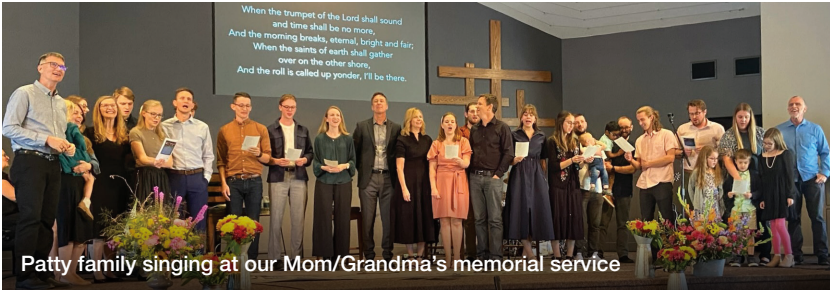
Patty family singing at our Mom/Grandma's memorial service

We are grateful for the heritage of our families, even as my brothers, sisters-in-law, and I have been going through