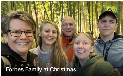
Forbes Family at Christmas