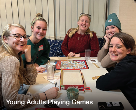
Young Adults Playing Games