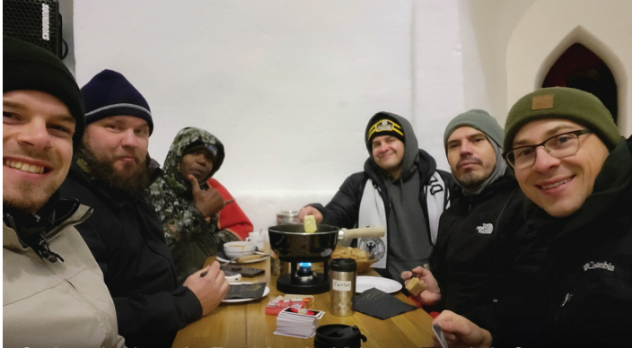
Graf men's trip to the Zugspitz, the highest mountain in Germany. We stayed overnight in an igloo.