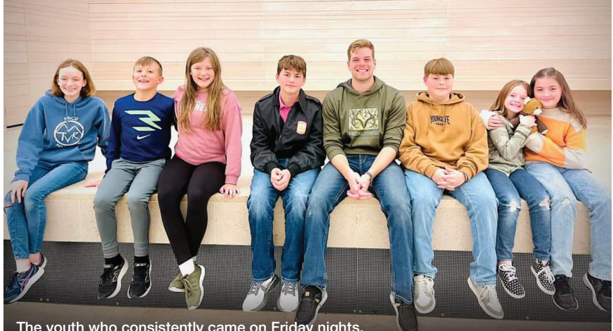
The youth who consistently came on Friday nights.

I hope to see all these people again one day, but whether in heaven or on earth, God is there for them, as He was faithfully present for me.