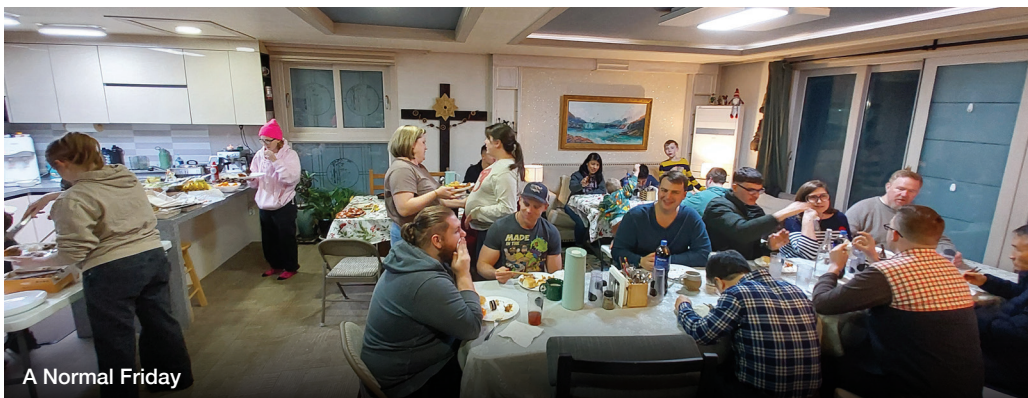
A Normal Friday