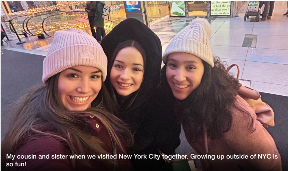
My cousin and sister when we visited New York City together. Growing up outside of NYC is so fun!