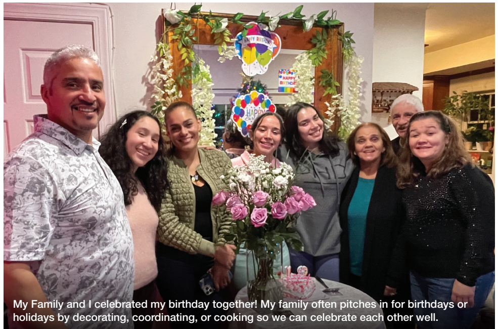
My Family and I celebrated my birthday together! My family often pitches in for birthdays or holidays by decorating, coordinating, or cooking so we can celebrate each other well.

I have chosen to serve with Cadence because the Lord has grown and continues to grow my desire to serve military kids and point them to Jesus during difficult circumstances. I remember struggling with many challenges as a teen, including anxiety and my physical health. Before knowing