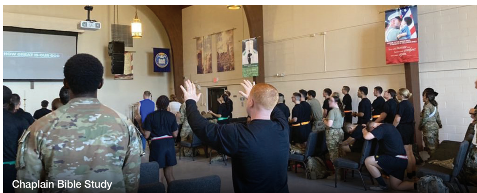
Chaplain Bible Study