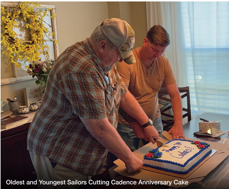
Oldest and Youngest Sailors Cutting Cadence Anniversary Cake