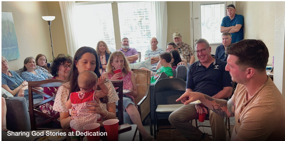
Sharing God Stories at Dedication

The San Antonio Cadence ministry officially has a name — Alamo City Cadence Community! “Alamo City” — a well-known nickname for San Antonio. And “Cadence Community” because we will build gospel-centered community wherever we gather, whether in our home or on JBSA Fort Sam Houston.