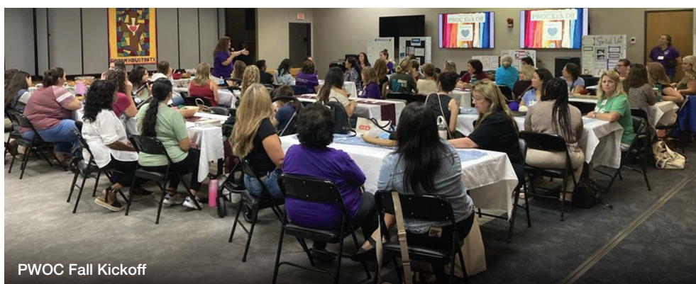
PWOC Fall Kickoff