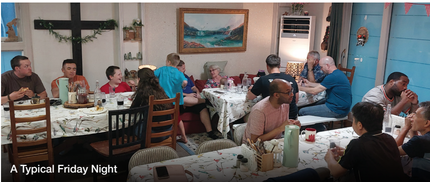
A Typical Friday Night