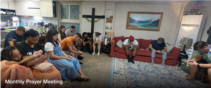
Monthly Prayer Meeting