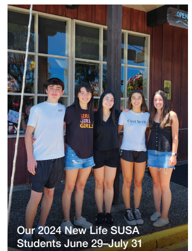
Our 2024 New Life SUSA Students June 29–July 31