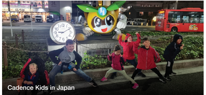
Cadence Kids in Japan