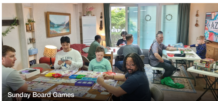
Sunday Board Games