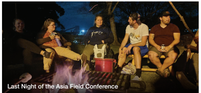
Last Night of the Asia Field Conference

The rest of this summer will be filled with pool days, picnics, Korean baseball games, a summer women’s Bible study, and lots of barbecues. We have also contacted a Korean realtor and are beginning to look at the houses surrounding Camp Humphreys. We would like to buy a permanent Cadence house here! Please pray for us as we start researching potential homes. We will keep you posted when we are further along and have a more concrete idea of our next steps.