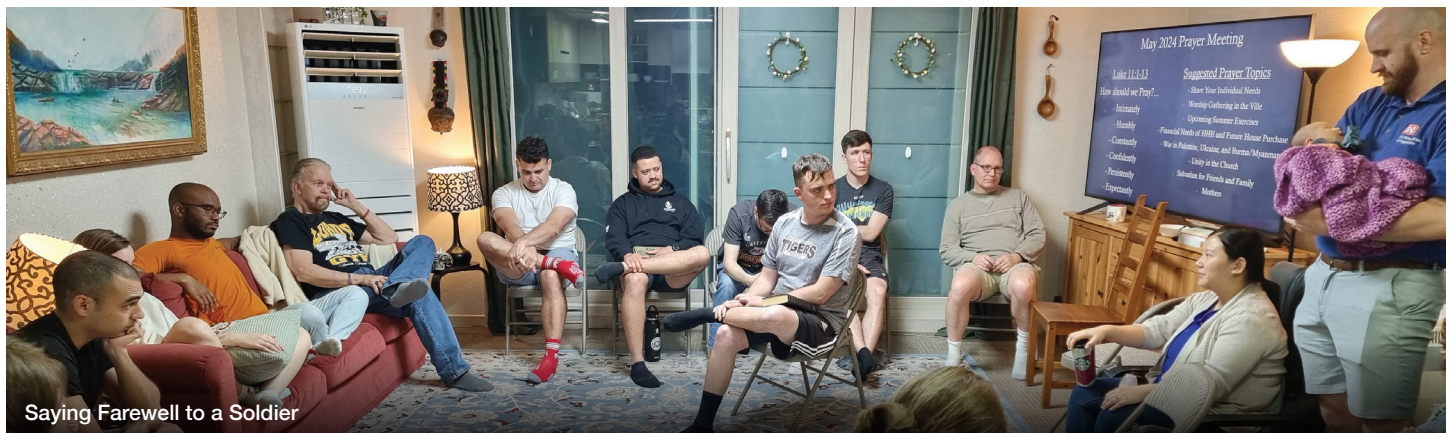
Saying Farewell to a Soldier