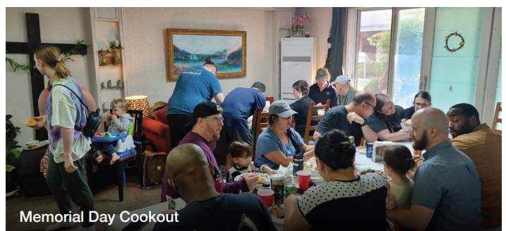
Memorial Day Cookout