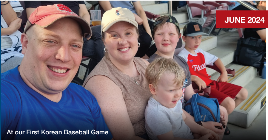
At our First Korean Baseball Game