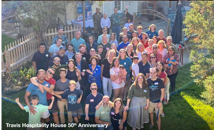
Travis Hospitality House 50 th Anniversary