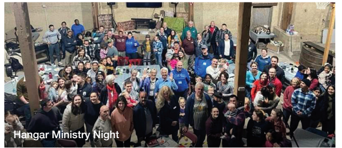
Hangar Ministry Night