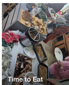
Time to Eat