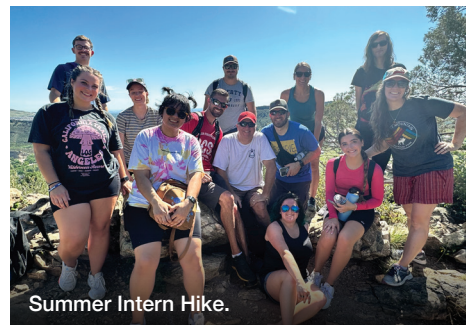
Summer Intern Hike.