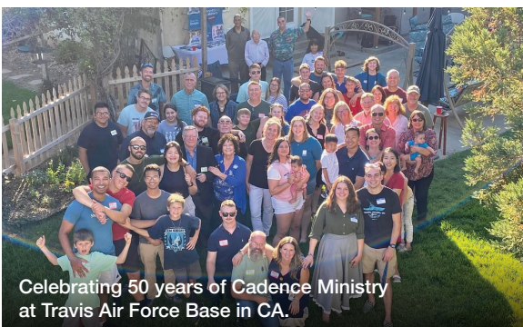
Celebrating 50 years of Cadence Ministry at Travis Air Force Base in CA.