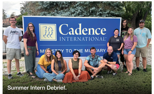
Summer Intern Debrief.