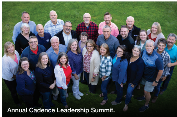
Annual Cadence Leadership Summit.