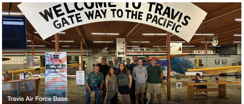
Travis Air Force Base.