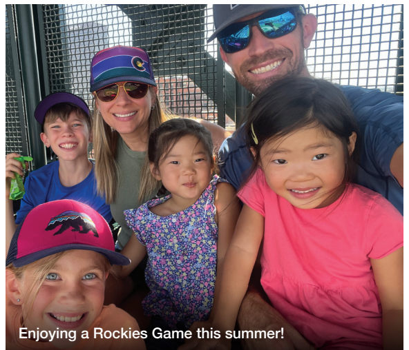
Enjoying a Rockies Game this summer!