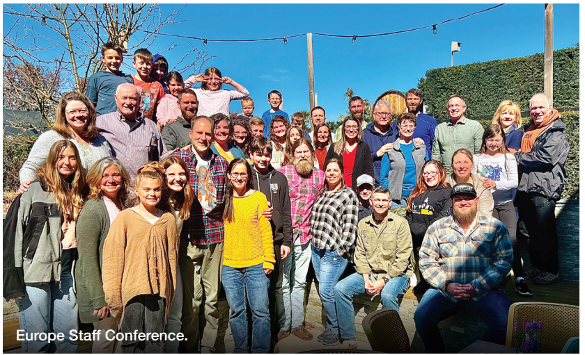
Europe Staff Conference.