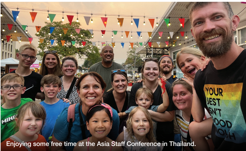
Enjoying some free time at the Asia Staff Conference in Thailand.