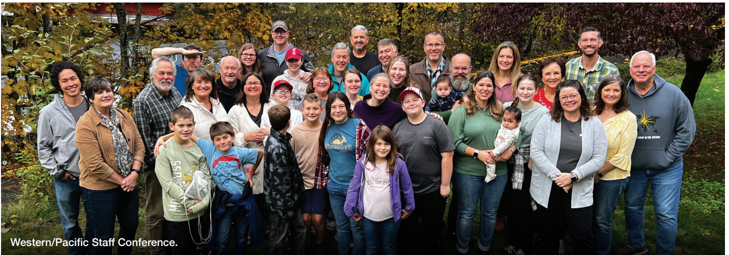
Western/Pacific Staff Conference.