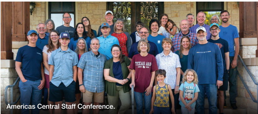
Americas Central Staff Conference.