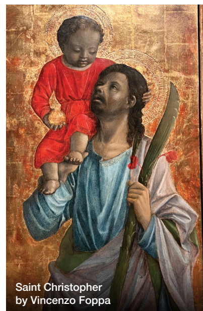
Saint Christopher by Vincenzo Foppa

F all is absolutely our favorite time of year! The trees are shedding their fiery orange, deep red, and peaceful yellow leaves. The temperature is falling and bringing in a chilling breeze that probably stokes most people's desire to curl up in a comfy blanket, put on warm socks, and make some hot chocolate. The anticipation of the Christmas season awakens our hearts as thoughts of family, food, and generosity fill our souls, while at the same time, Mariah Carey sings to us ad nauseam and fills our ears. This season carries an abundance of paradoxes. Life around us is dying: trees become dormant, animals hibernate, and humanity seeks shelter, bringing separation from the usual interactions and relationships outside the home. During these days, our family kicks into a higher gear of invitation into our home, into relationships, and into hospitality as we remember a God who chose to become a helpless baby to draw us near to Him.