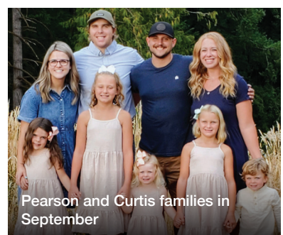
Pearson and Curtis families in September