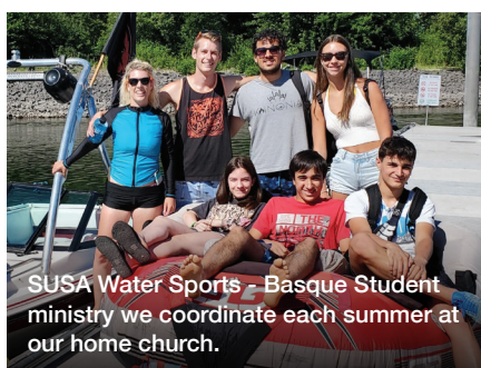
SUSA Water Sports - Basque Student ministry we coordinate each summer at our home church.