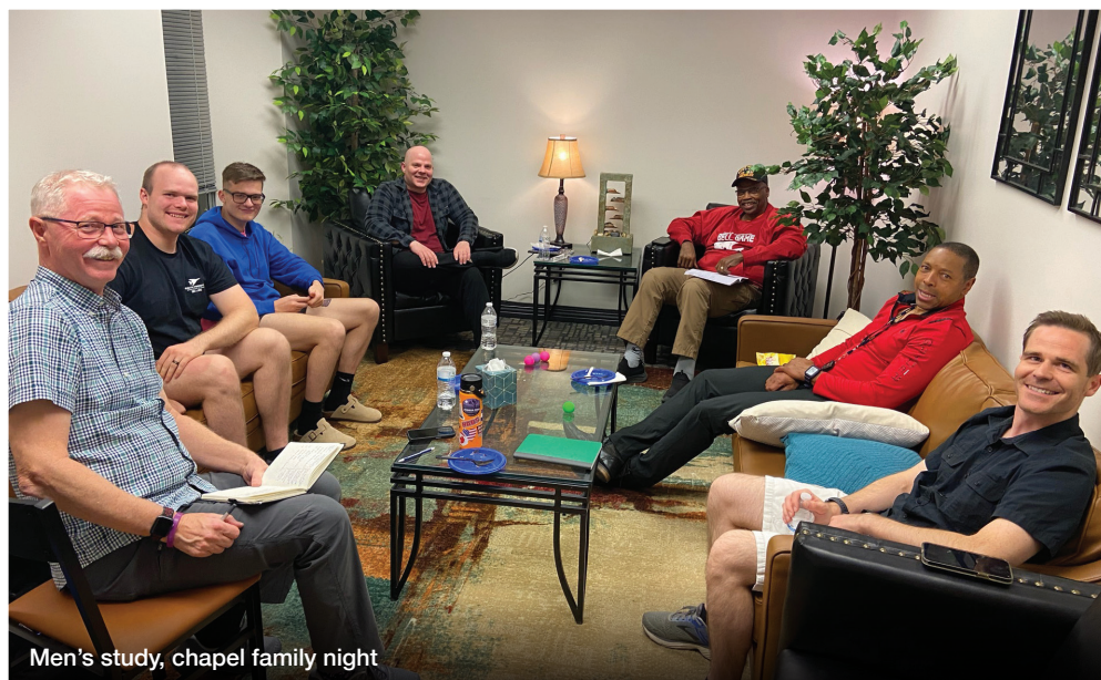
Men's study, chapel family night