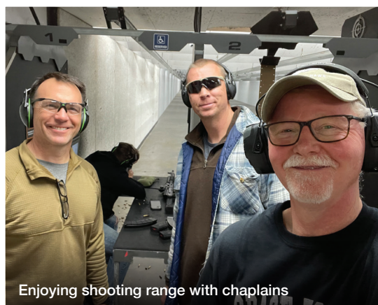
Enjoying shooting range with chaplains