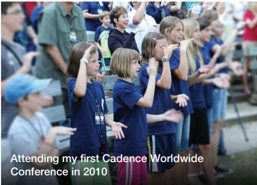
Attending my first Cadence Worldwide Conference in 2010

With a focus on military communities, I will partner with local missionaries serving Camp Foster in Okinawa, Japan. During my internship, I will