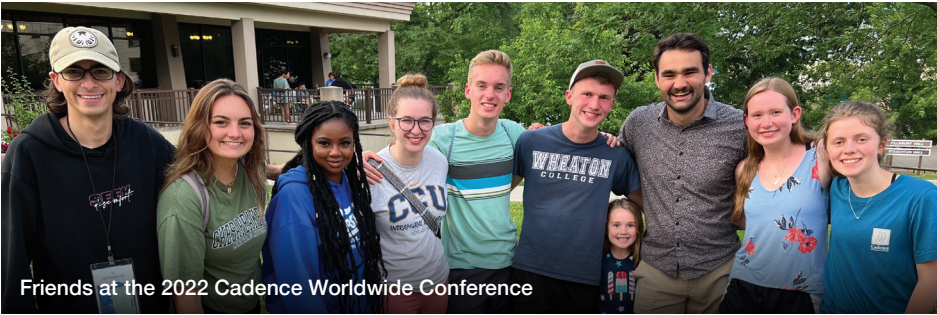
Friends at the 2022 Cadence Worldwide Conference