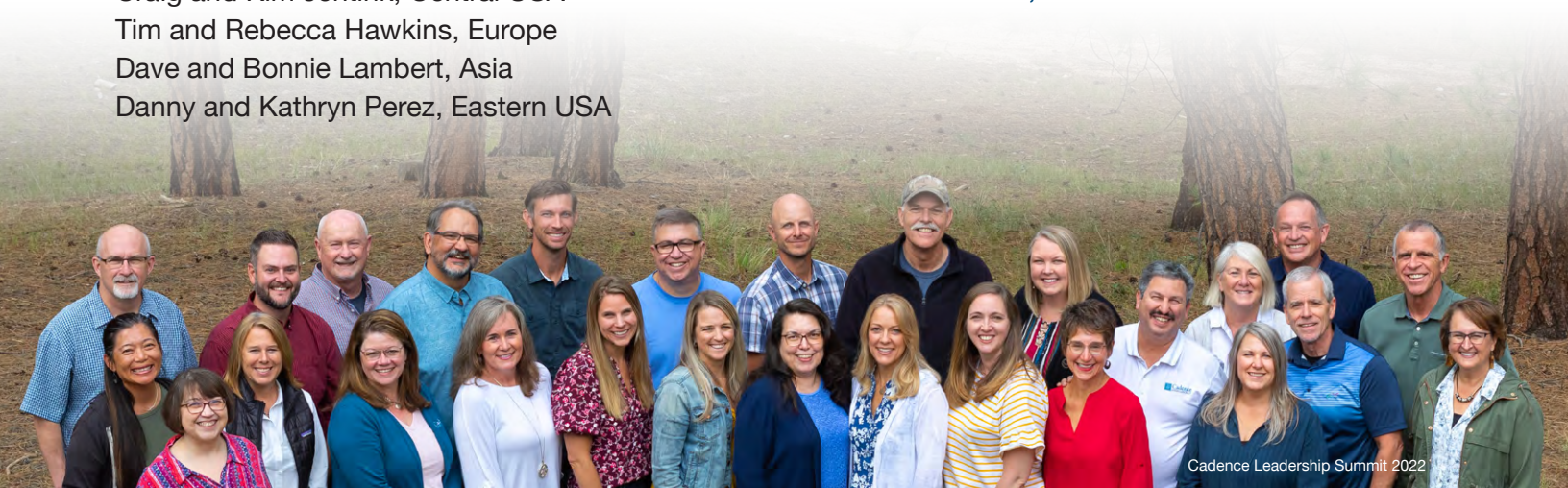
Cadence Leadership Summit 2022