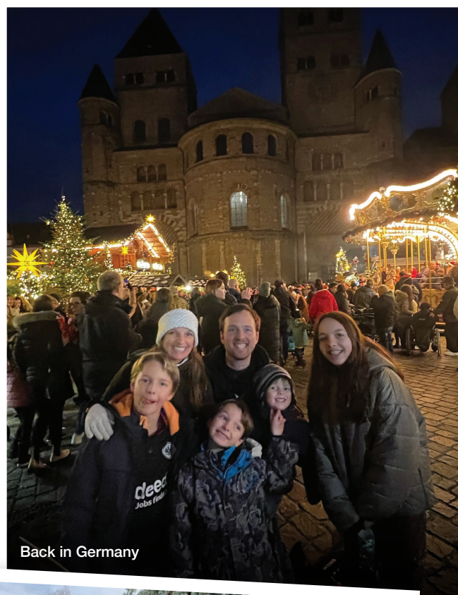
Back in Germany

As we celebrate advent, we remember that our faith is dependent on Christ. He is not only a historical person but also our Savior. He was prophesied about in the Old Testament, born among men, crucified on the cross, and raised from the dead. He is alive today, and we await His return. How can Jesus be good news of great joy? How is a baby lying in a manger a sign? Shepherds raise sheep, and the importance of sheep in the second temple period was found in their sacrifice on Pesach (Passover). John the Baptist makes this link explicitly when he sees Jesus come to be baptized: “Behold, the Lamb of God, who takes