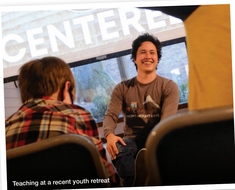
Teaching at a recent youth retreat

We will be taking a home assignment starting later this summer. "Home assignment" is similar to a sabbatical. We will be moving back to the States from Okinawa for at least one year. It has been a bittersweet and emotional last few months as we come to the end of our time here. This is the only home we have known as a family. We will be leaving many wonderful