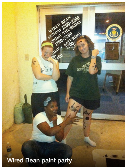
Wired Bean paint party