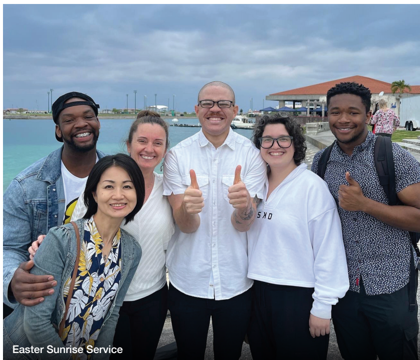
Easter Sunrise Service