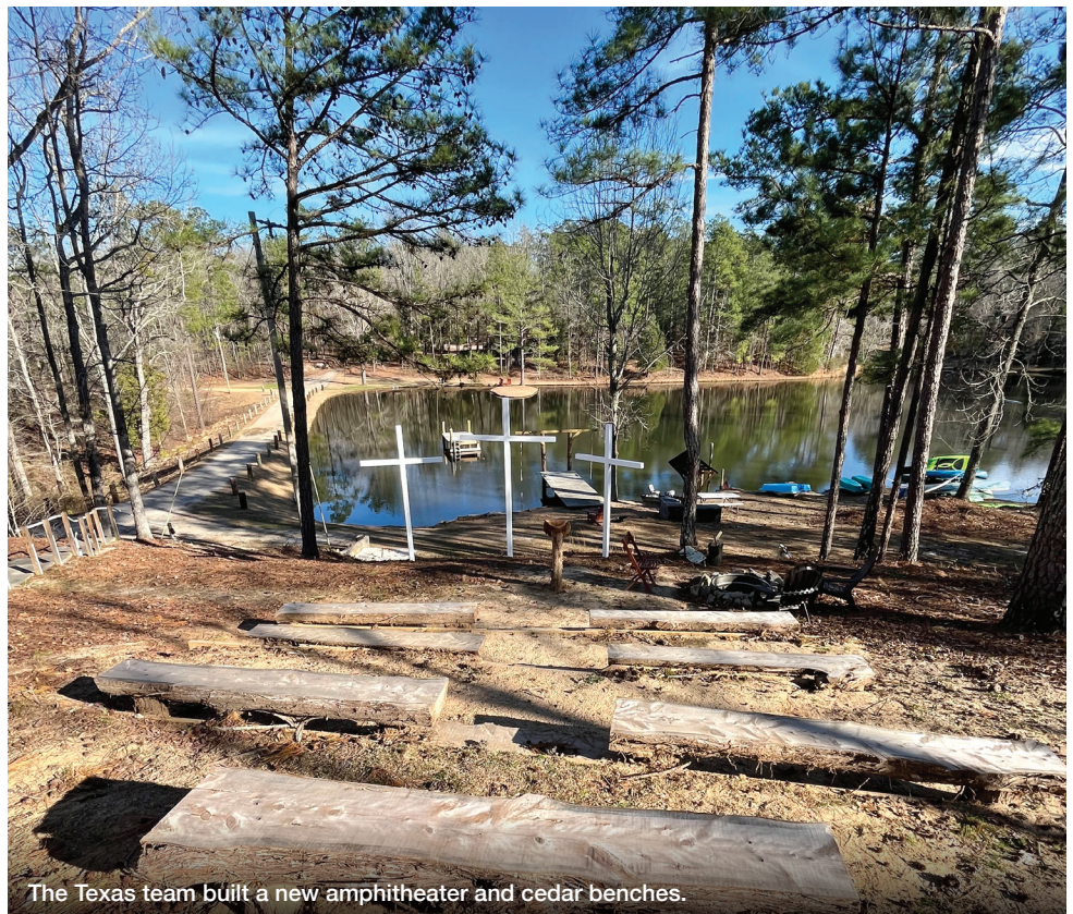
The Texas team built a new amphitheater and cedar benches.