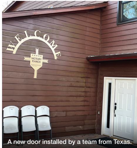
A new door installed by a team from Texas.