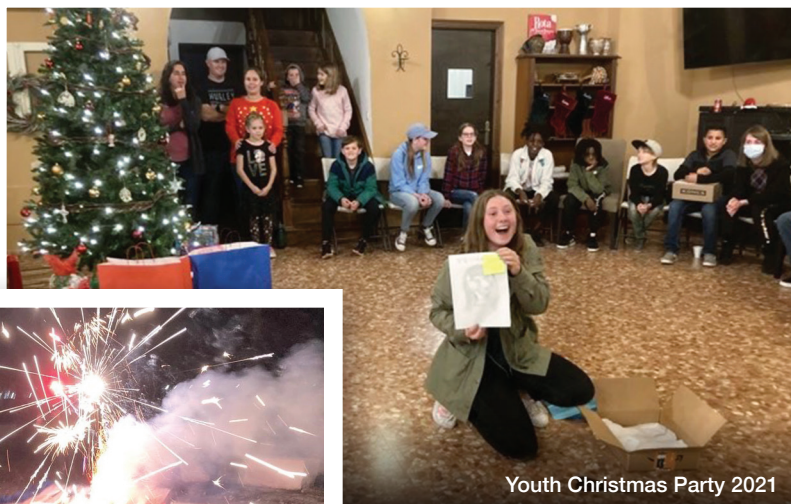
Youth Christmas Party 2021