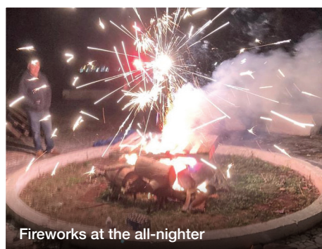
Fireworks at the all-nighter