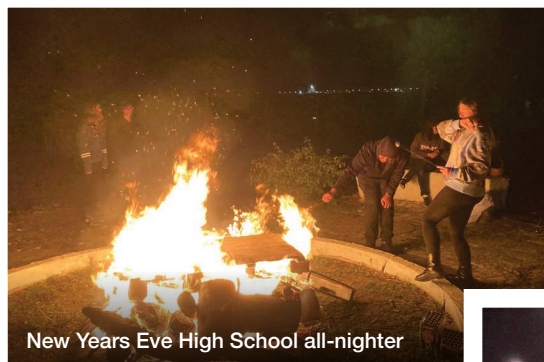
New Years Eve High School all-nighter