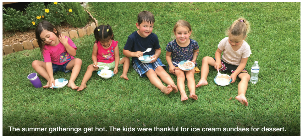
The summer gatherings get hot. The kids were thankful for ice cream sundaes for dessert.