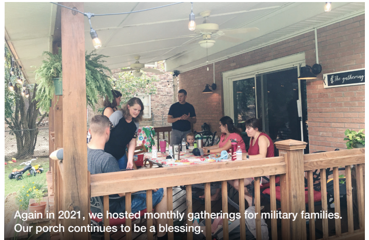
Again in 2021, we hosted monthly gatherings for military families. Our porch continues to be a blessing.