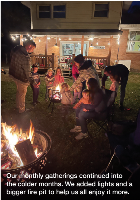
Our monthly gatherings continued into the colder months. We added lights and a bigger fire pit to help us all enjoy it more.