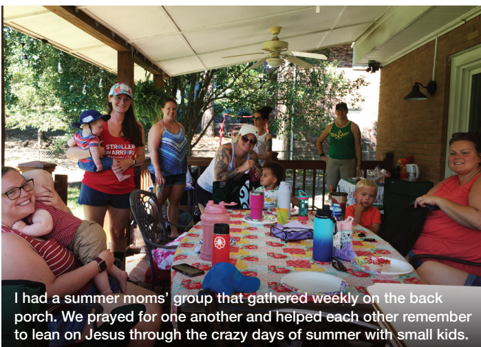
I had a summer moms' group that gathered weekly on the back porch. We prayed for one another and helped each other remember to lean on Jesus through the crazy days of summer with small kids.