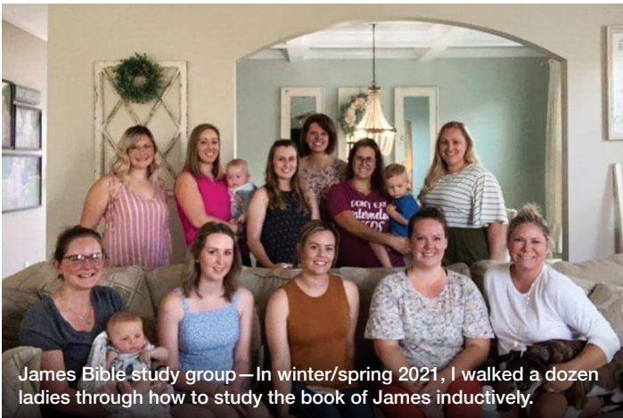
James Bible study group — In winter/spring 2021, I walked a dozen ladies through how to study the book of James inductively.

Happy New Year! Last year was full of sweet ministry and keeping up with my growing kids. Here are a few snapshots of all that happened, with some of the dear faces that filled the year.