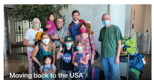
Moving back to the USA