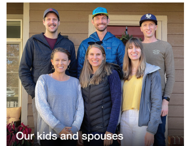
Our kids and spouses