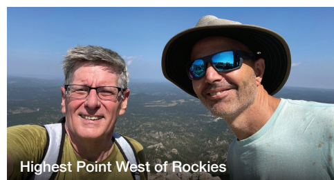
Highest Point West of Rockies