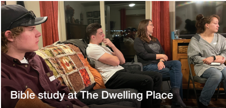
Bible study at The Dwelling Place