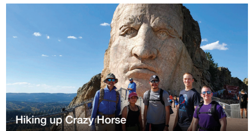
Hiking up Crazy Horse