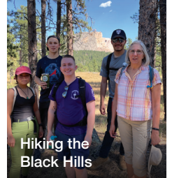
Hiking the Black Hills