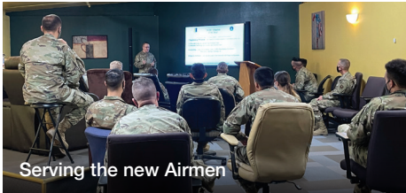
Serving the new Airmen