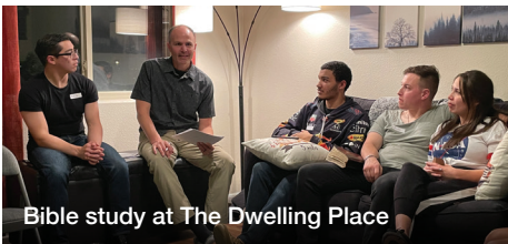
Bible study at The Dwelling Place