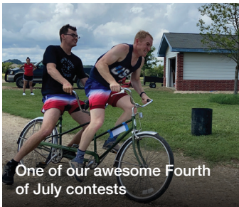
One of our awesome Fourth of July contests