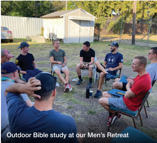
Outdoor Bible study at our Men's Retreat