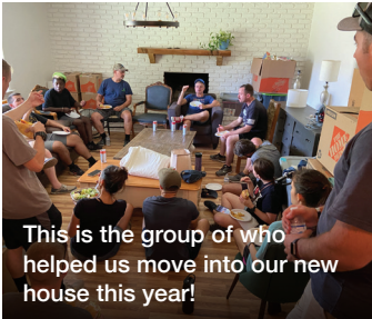
This is the group of who helped us move into our new house this year!

WE'VE MOVED! 225 Lonely Oaks Lane Killeen, TX 76542