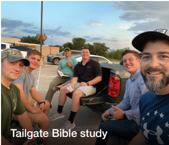
Tailgate Bible study