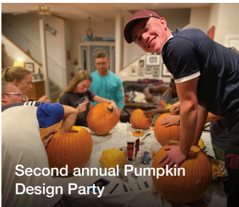
Second annual Pumpkin Design Party