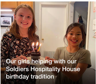
Our girls helping with our Soldiers Hospitality House birthday tradition