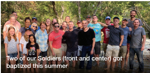
Two of our Soldiers (front and center) got baptized this summer