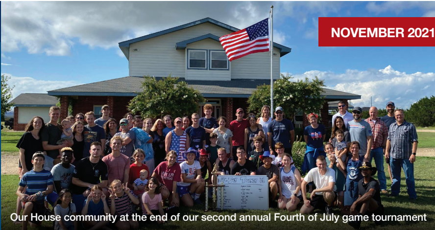
Our House community at the end of our second annual Fourth of July game tournament

To all our friends and family who encourage us, pray for us, and support our military ministry here at Fort Hood, Texas, THANK YOU!