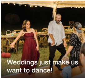
Weddings just make us want to dance!