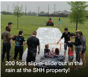
200 foot slip-n-slide out in the rain at the SHH property!