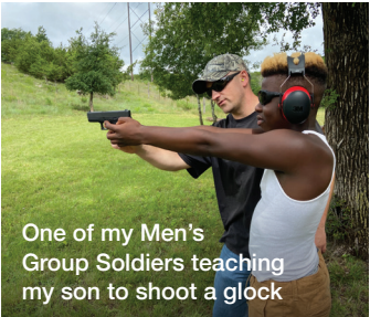
One of my Men's Group Soldiers teaching my son to shoot a glock