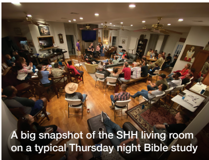
A big snapshot of the SHH living room on a typical Thursday night Bible study