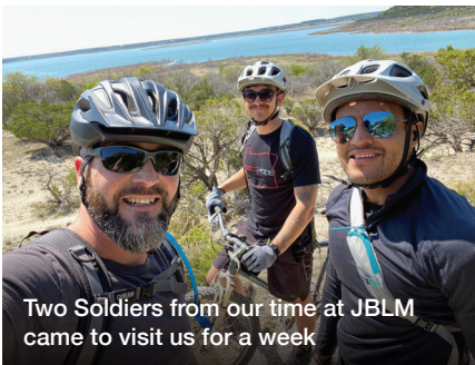
Two Soldiers from our time at JBLM came to visit us for a week