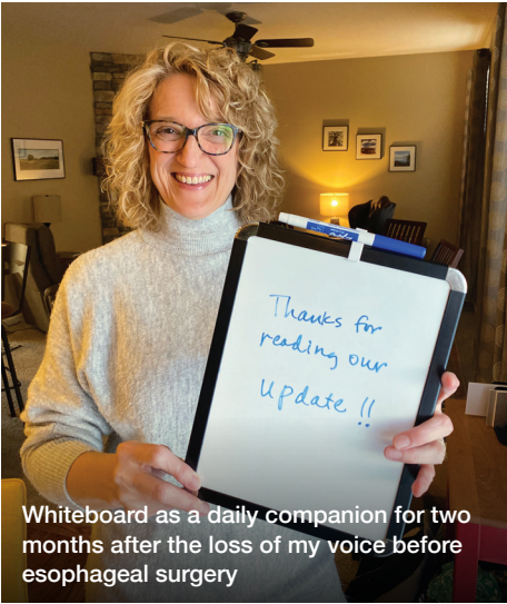
Whiteboard as a daily companion for two months after the loss of my voice before esophageal surgery