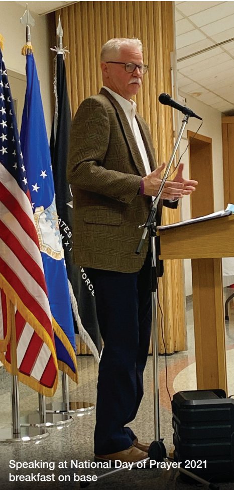
Speaking at National Day of Prayer 2021 breakfast on base

Together we have faced some difficult health issues as well. In October 2020, my esophagus began to malfunction. This painful journey ended in esophageal surgery in August 2021. How thankful we are that God showed us such kindness through the military families we love. They prayed,