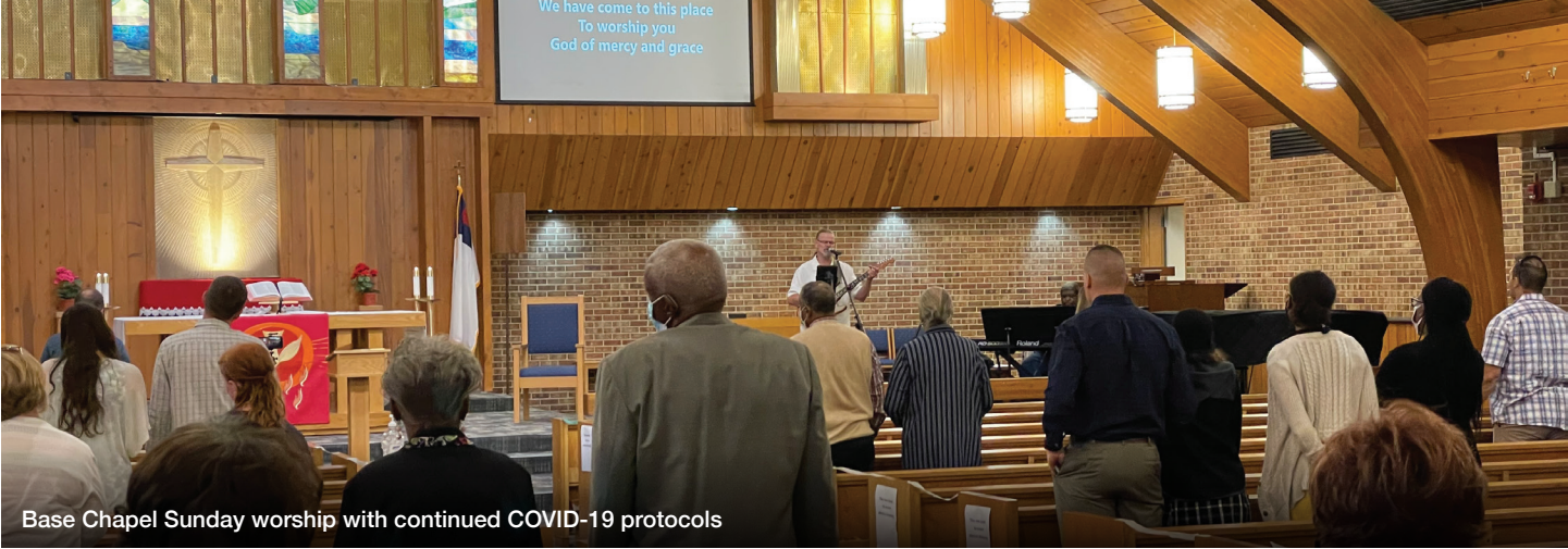
Base Chapel Sunday worship with continued COVID-19 protocols