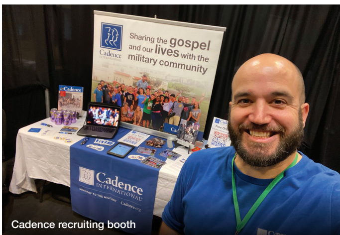
Cadence recruiting booth

Would you prayerfully consider donating a year-end gift? And as the New Year approaches and you build your budget