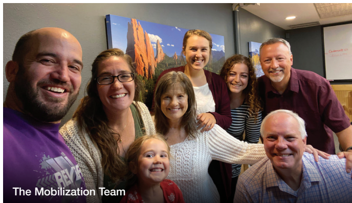
The Mobilization Team