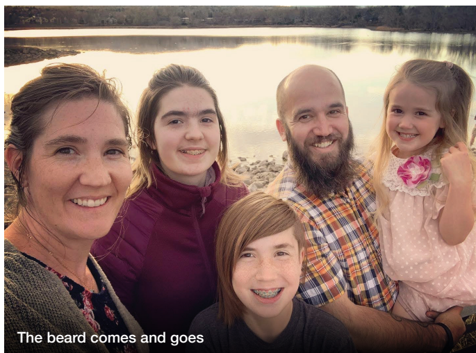
The beard comes and goes