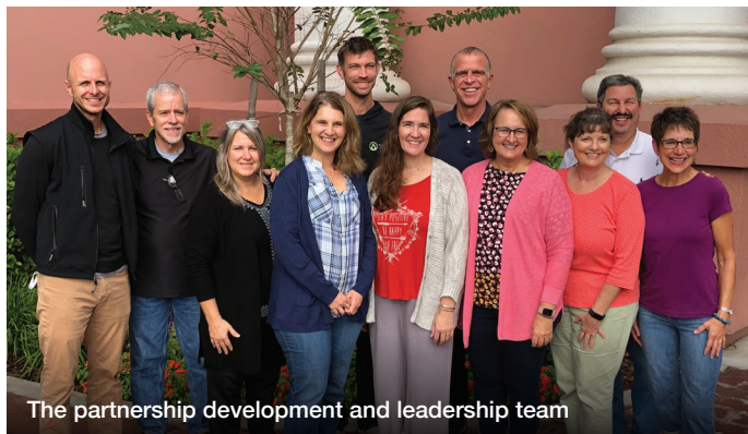
The partnership development and leadership team

for next year, would you think about adding us to your monthly giving, or increasing if you already give?