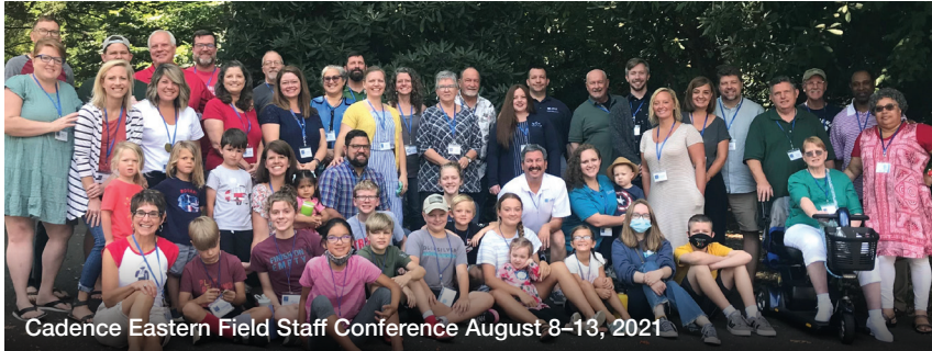
Cadence Eastern Field Staff Conference August 8–13, 2021

Grace and peace to you all! We pray you are basking in the love of the Father, the forgiveness and mercy of the Savior, and the fellowship of the Spirit. He is the reason we all live and breathe.