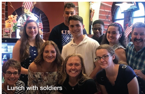
Lunch with soldiers