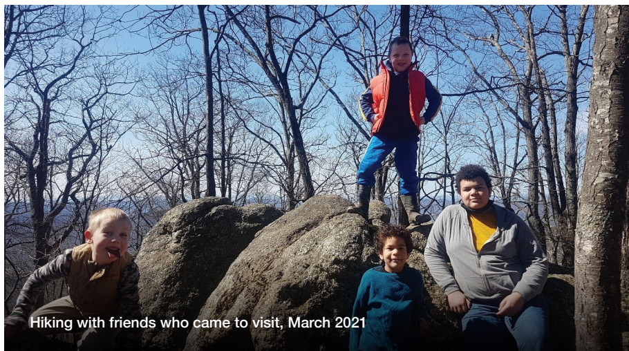
Hiking with friends who came to visit, March 2021

In 2019, I visited again and instantly reconnected with the friends I had made a few years earlier. My visit overlapped with a yearly trip to Oxford the Graf House did and I joined them. That week was a wonderful time of fellowship, learning, and enjoyment. It was amazing to see people from many different backgrounds coming together with a shared desire to pursue God."