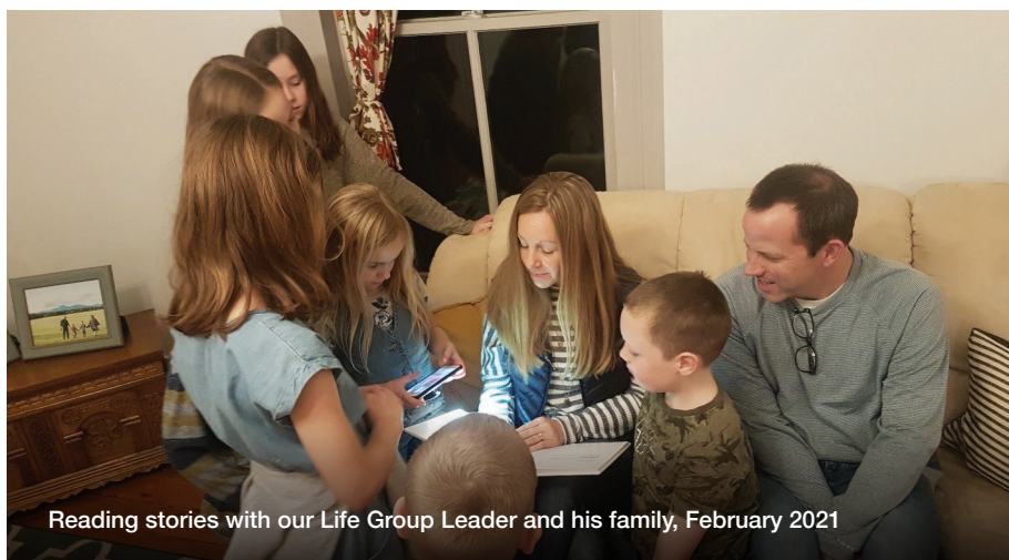
Reading stories with our Life Group Leader and his family, February 2021

Our next short-term goal is to reach 34% of our total need by the end of April. As of the writing of this newsletter, we are rapidly approaching 30% in monthly support! With more fundraising appointments on the calendar, we are eager to see how God will continue to provide for us. We are still far from our