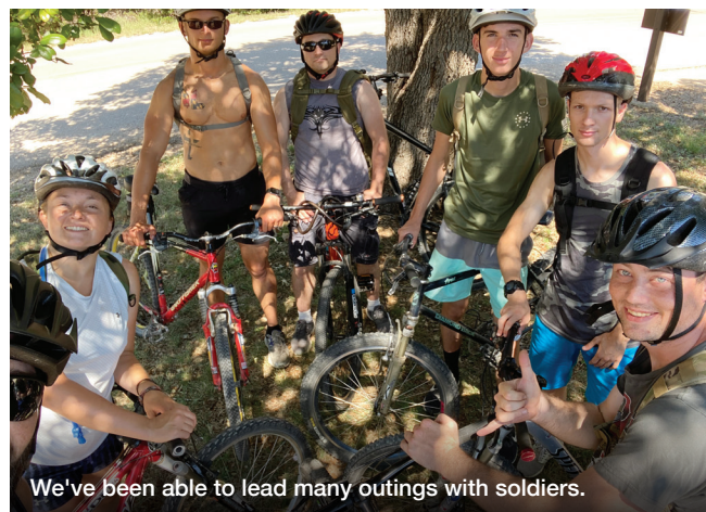
We've been able to lead many outings with soldiers.