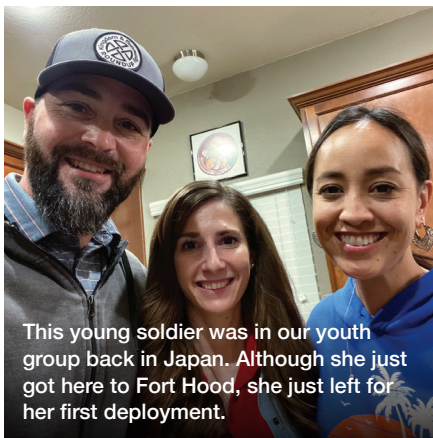
This young soldier was in our youth group back in Japan. Although she just got here to Fort Hood, she just left for her first deployment.