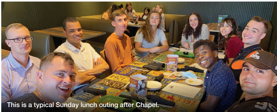
This is a typical Sunday lunch outing after Chapel.