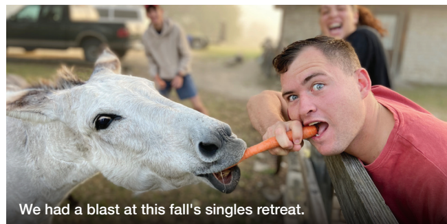
We had a blast at this fall's singles retreat.