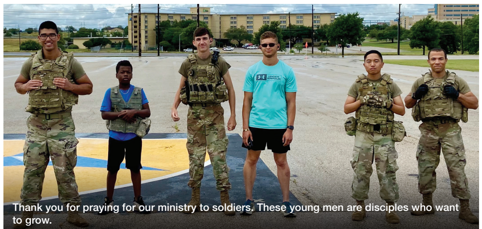
Thank you for praying for our ministry to soldiers. These young men are disciples who want to grow.