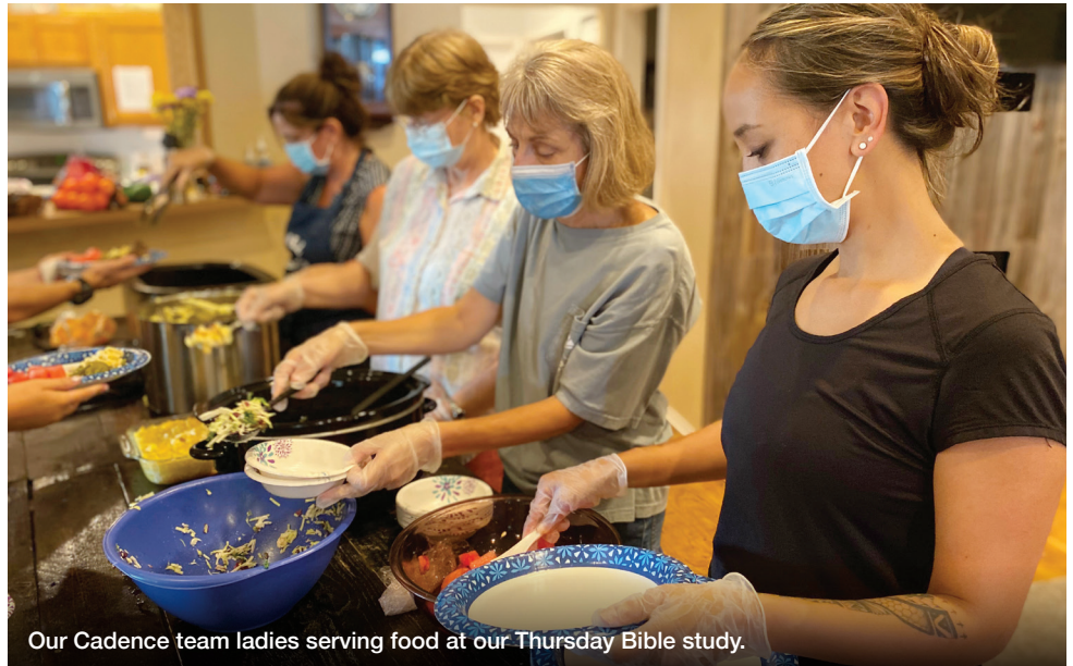
Our Cadence team ladies serving food at our Thursday Bible study.