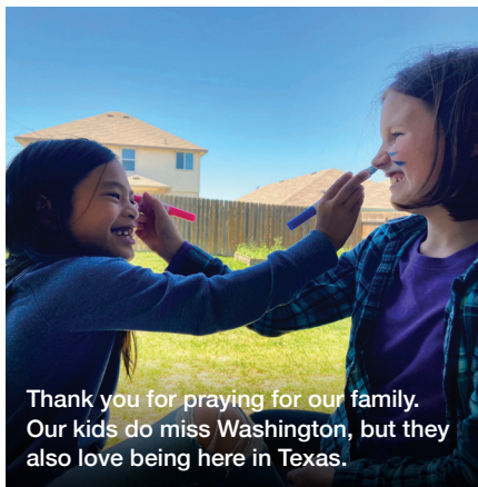
Thank you for praying for our family. Our kids do miss Washington, but they also love being here in Texas.