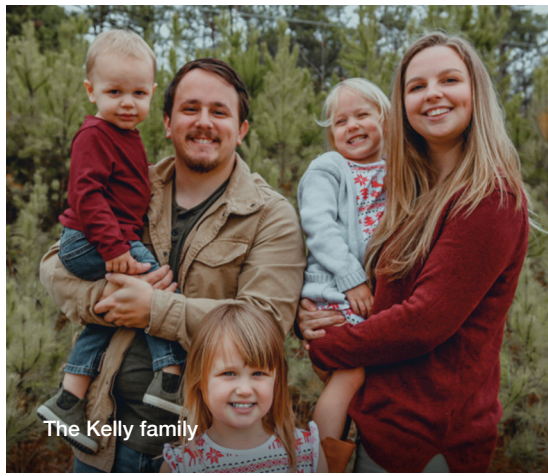
The Kelly family

“No one sews a patch of unshrunk cloth on an old garment, for the patch will pull away from the garment, making the tear worse. Neither do men pour new wine into old wineskins. If they do, the skins will burst, the wine will run out and the wineskins will be ruined. No, they pour new wine into new wineskins, and both are preserved.”