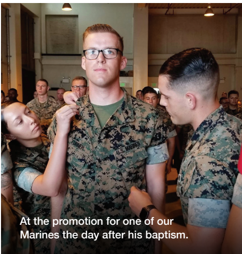
At the promotion for one of our Marines the day after his baptism.