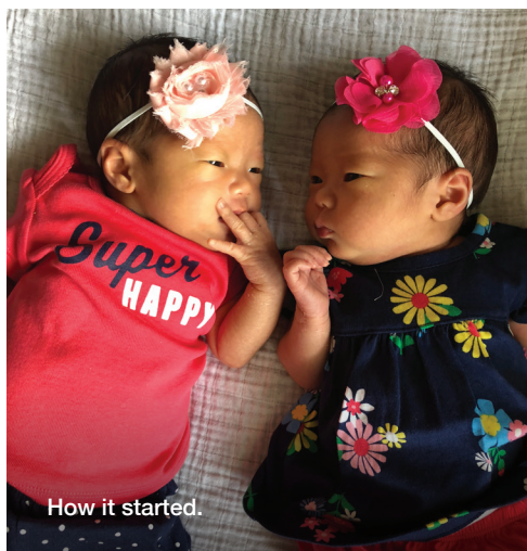
How it started.

Secondly, it is a time for family. Between retreats, conferences, and a variety of other responsibilities, there has been plenty of travel in the past few years, and the coming years will be no exception. To have a year of more focused presence as a family, to play, process, and live together is a blessing that we are very much enjoying.