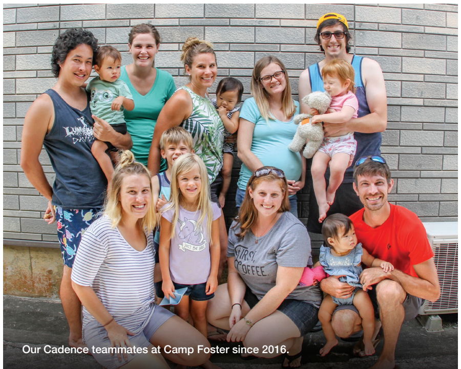
Our Cadence teammates at Camp Foster since 2016.