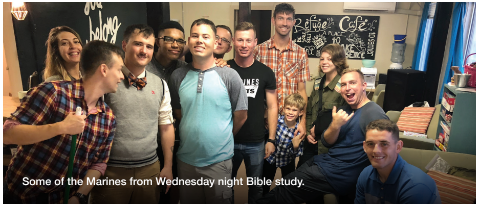
Some of the Marines from Wednesday night Bible study.