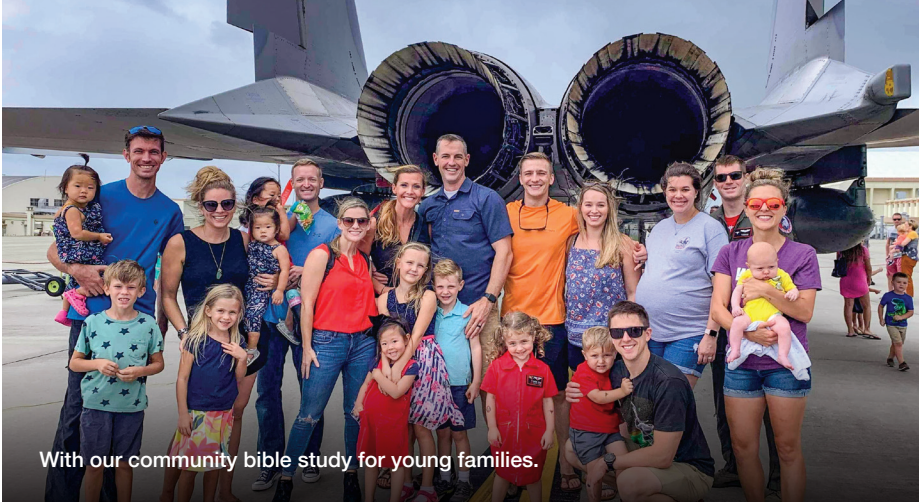
With our community bible study for young families.