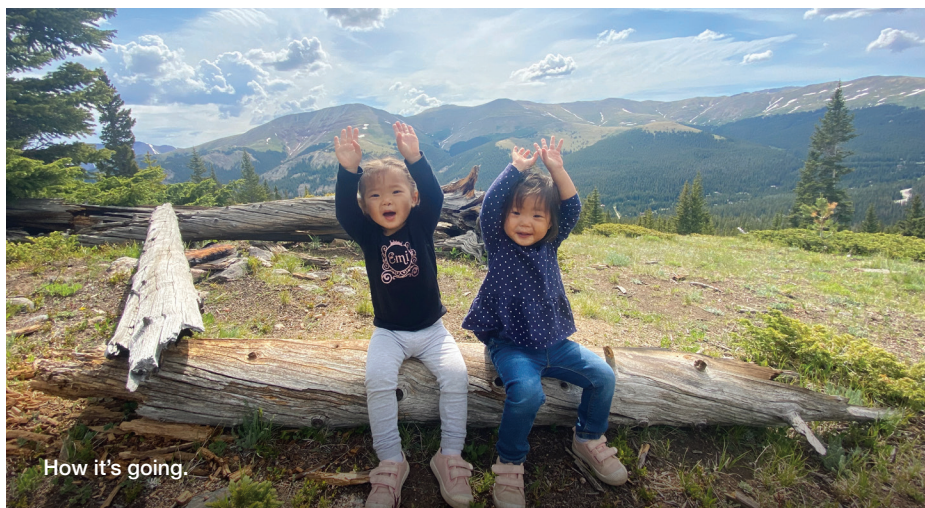
How it's going.