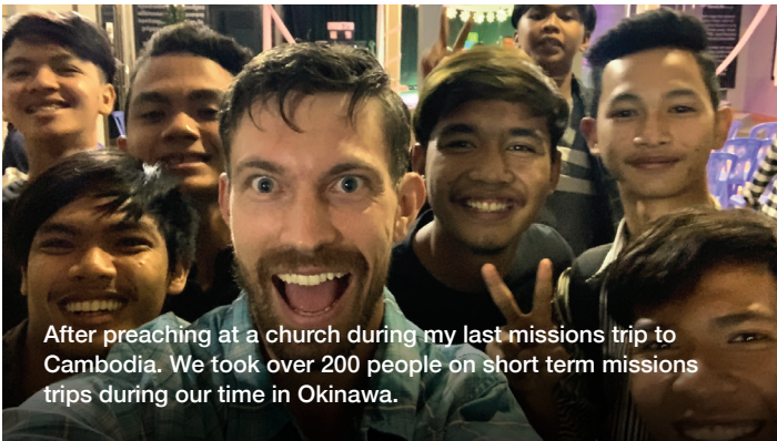
After preaching at a church during my last missions trip to Cambodia. We took over 200 people on short term missions trips during our time in Okinawa.