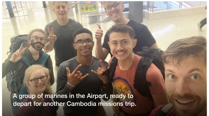
A group of marines in the Airport, ready to depart for another Cambodia missions trip.