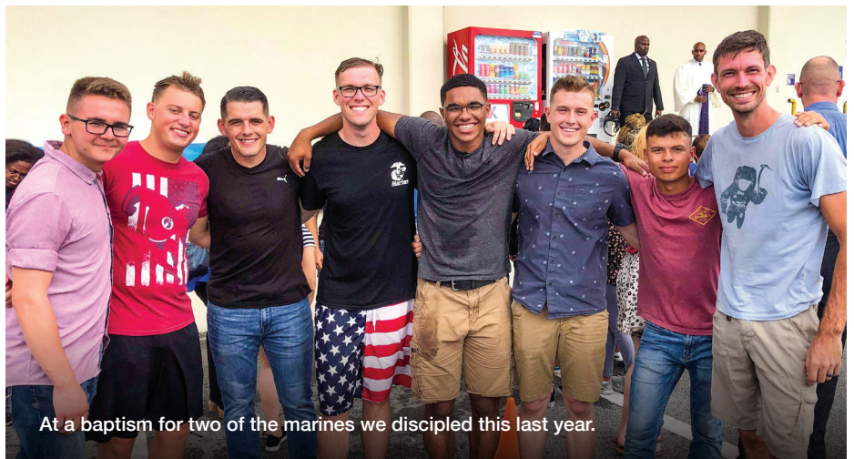
At a baptism for two of the marines we disciplined this last year.