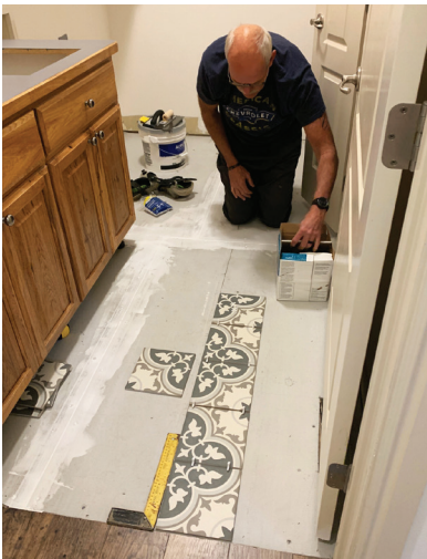
In May, we moved into a new home in Eagle, Idaho. The beauty of nature we experience when we step out our backdoor ministers to our souls on a daily basis. A fairly major water leak back in July has meant we’ve had our fair share of repair projects in the last four months (good thing I have such a handy husband!).